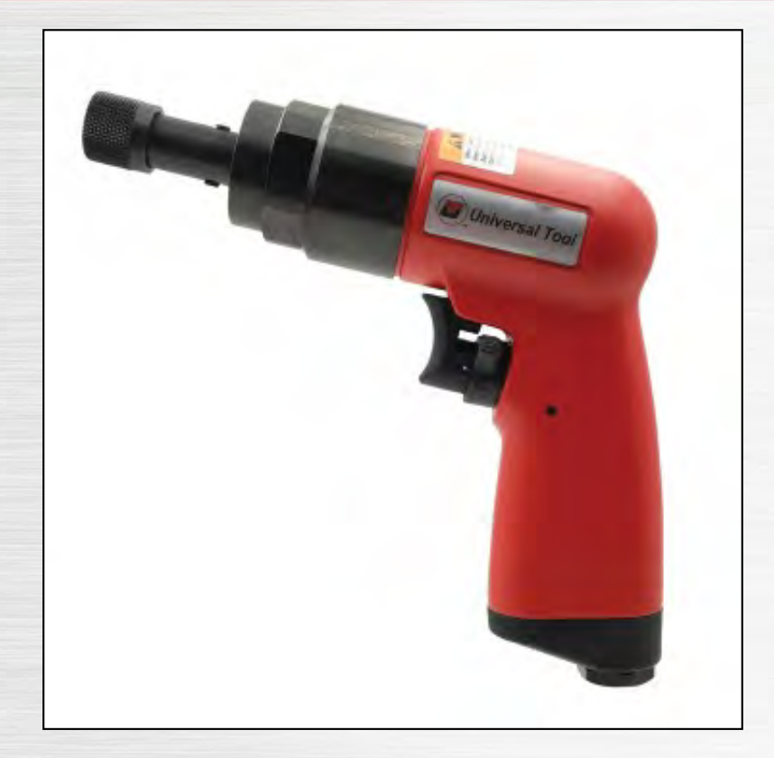
Air Tools for Industry