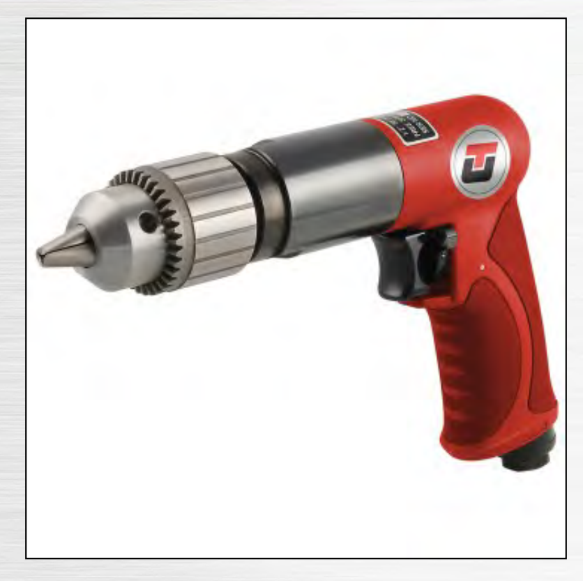
Air Tools for Industry