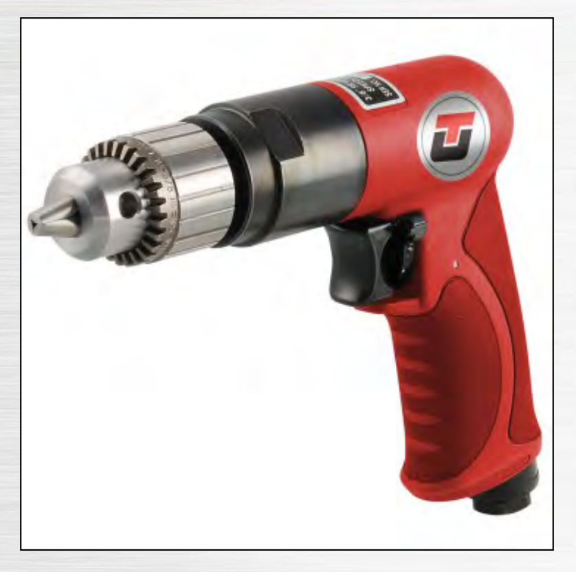
Air Tools for Industry