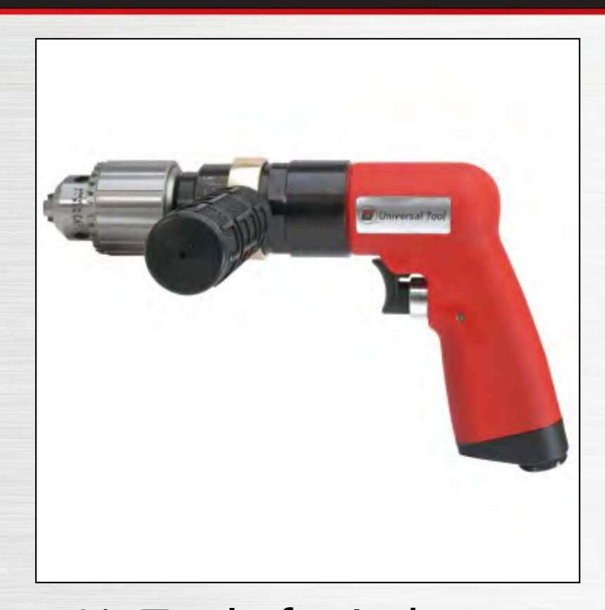
Air Tools for Industry