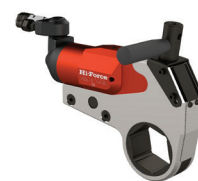
Handle kits for TWH27N, TWH54N, TWH120N & TWH210N