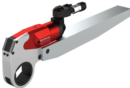
TWH-N fitted with extended reaction arm