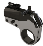
Handle kits for TWH430N